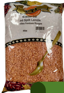
PTI Red Lentils 4lbs