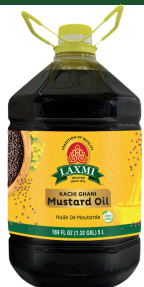
Laxmi Mustard Oil 5 Litres