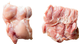
Chicken Thigh Boneless Per lb