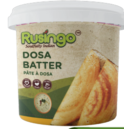
Rusingo Dosa Batter 900g