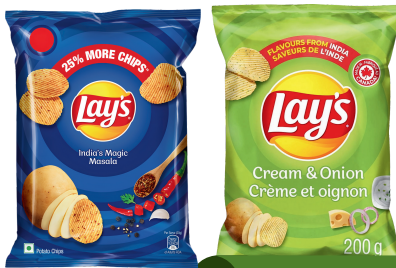
Lays Chips 200g