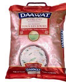
Daawat Everyday Rice 10lbs