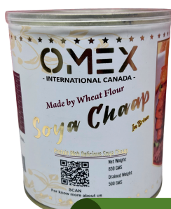
Omex Soya Chaap 850g