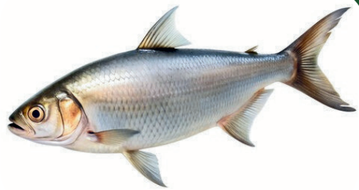
Mrigal Per lb