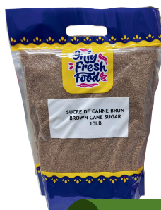
OnlyFresh Brown Sugar 10lbs