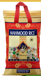
Mahmood Rice 10lbs