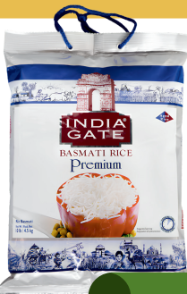
India Gate Premium Basmati Rice 10lbs