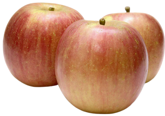
Fuji Apples Per lb