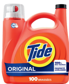
Tide Detergent 3.9L