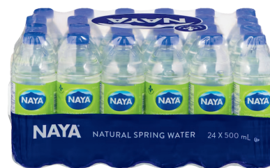
Naya Water 24-Pack