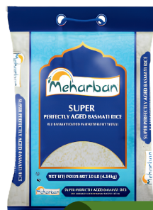
Meharban Rice 10lbs