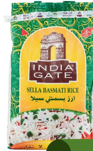
India Gate Sella Basmati Rice 10lbs