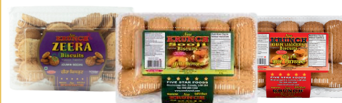
New Krunch Cookies