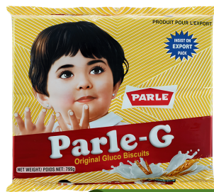
Parle-G Biscuits 799g