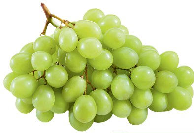
Green Grapes Per lb