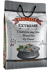
Handi Extreme Basmati Rice 10lbs