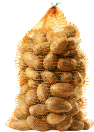
Russet, Yellow & Red Potato Bag 10 lbs