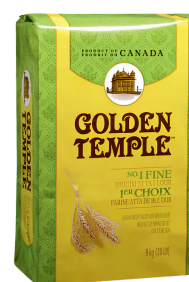
Golden Temple Aata 20lbs