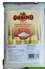
Gobind Sugar 10lbs