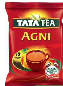
Tata Agni Tea 1kg