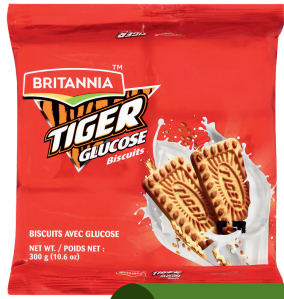
Britannia Tiger Biscuit 300g