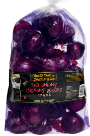
Red Onion Bag 10 lbs