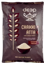
Deep Chakki Aata 20lbs