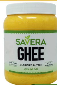
Savera Desi Ghee 1.6kg