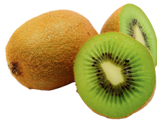
Kiwis Per lb