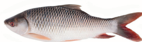
Rohu (Scales Off) Per lb