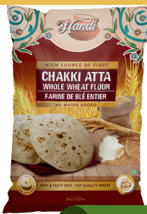
Handi Chakki Aata 20lbs