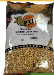
PTI Chana Dal 4lbs