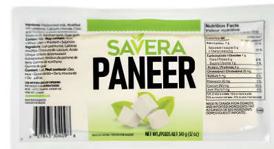
Savera Paneer 341g