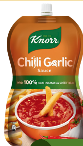
Knorr Chilli Garlic Sauce