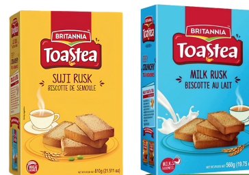
Britannia Suji/Milk Rusk 305g