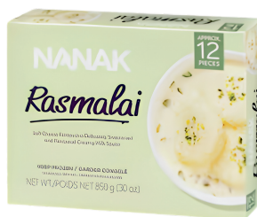
Nanak Rasmalai 850g