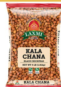
Laxmi Kala Chana 4lbs