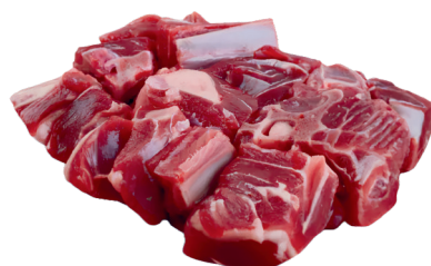
Frozen Goat Cubes Per lb