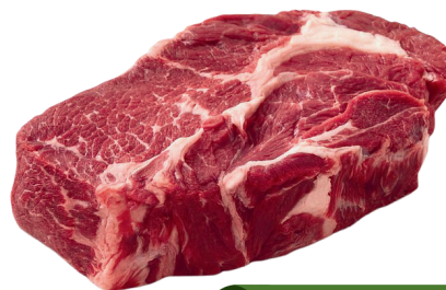
Boneless Beef Per lb