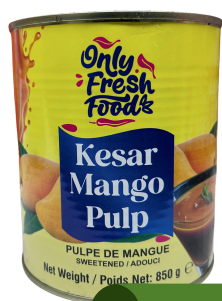
OnlyFresh Kesar Mango Pulp 850g