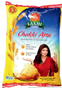
Laxmi Chakki Aata 20lbs