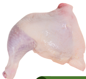
Chicken Leg Quarter Per lb