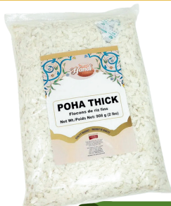
Handi Thick Poha 2lbs