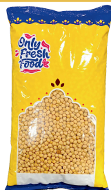
Only Fresh Kabuli Chana 4lbs