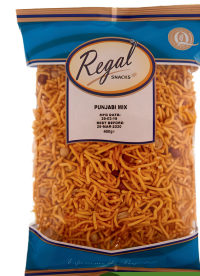
Regal Snacks Punjabi Mix 372g