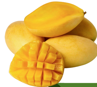
Yellow Mango Per lb