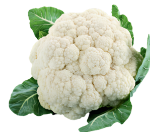
Cauliflower Per lb