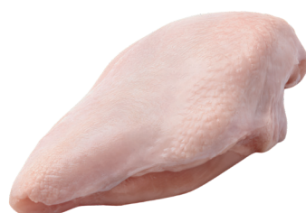
Chicken Breast Per lb