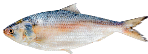
Hilsa Per lb