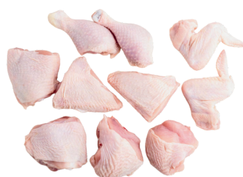
Whole Chicken Clean & Cut Per lb