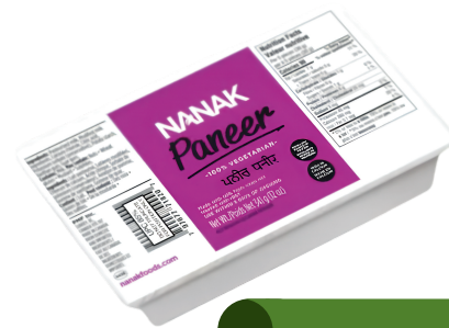
Nanak Paneer 341g