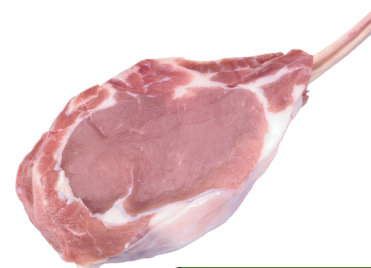
Veal with Bone Per lb