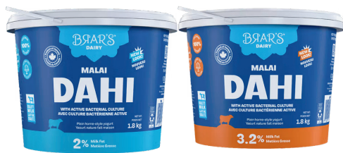
Brar Dahi 2% and 3.2% 1.8kg