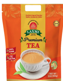
Laxmi Premium Tea 2lbs