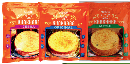
Deep Khakhara 200g